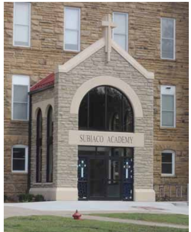
A new front entrance to the Academy was part of the campaign