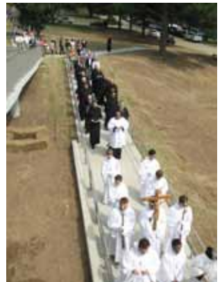
Procession from church to Fuhrmann Hall

Like all religious in the Church during the last couple of centuries, when communities were growing and thriving with many members, the Subiaco monks did not think about setting up a fund for care of their aging members. There were plenty of monks to do the labor, and health care expenses were moderate. Whatever funds were left over after bills were paid were invested in the ministries, such as our Academy, so that we could provide more assistance to families with reduced resources.