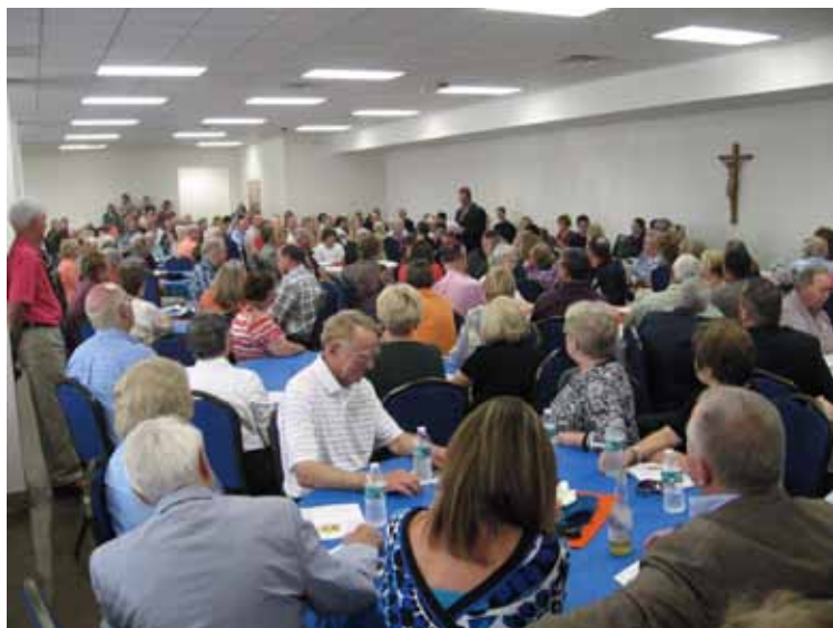
An estimated 600 people attended the dedication of Fuhrmann Hall

After Mass we moved from the Church to the dedication of Fuhrmann Hall, the residence hall and conference center that is a major fruit of the campaign. In its own way the naming of the hall sends a message of faith and gratitude: honoring a family which produced an amazing number of religious vocations both here at Subiaco and in other religious communities and dioceses. The Fuhrmann family did not have an organized plan to provide so many religious for the Church, and at any rate the call always comes from God; but the life of prayer and faith in their family provided the seedbed of faith where members were free and encouraged to listen for God's call.