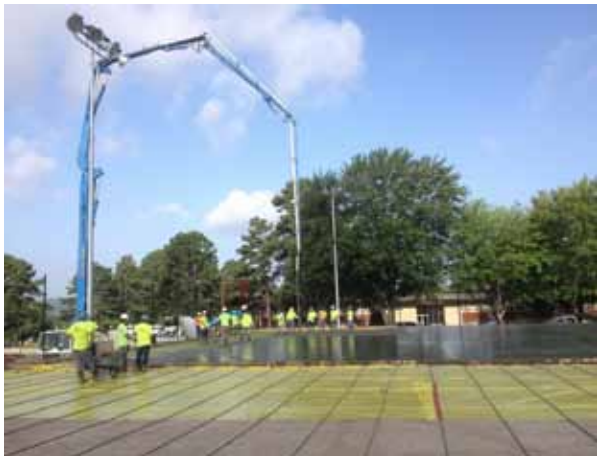
Pouring cement for the renewed tennis courts

An early morning stroll found the tennis court lights blazing at 5:00 a.m. A closer look found 20 workers swarming over the site. The pumper truck's jointed proboscis hovered and dipped, disgorging concrete to the scurrying, and strangely silent, human workers. The whole scene was eerie, alien, dystopian. Or have I seen too many bad movies? Actually, such before daylight urgency only meant that the summer weeks were rapidly ticking down to a deadline—the students return in mid-August.